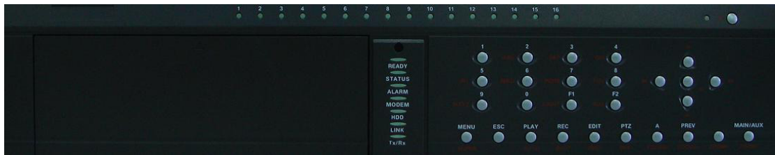
JDS-8000HDI-S Front Panel

JDS-8000HDI-S series combines the advantages of Digital Video Recorder (DVR) and Digital Video Server (DVS). It is widely applied as a stand-alone unit or a part of a powerful surveillance system.